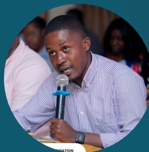
Lord Offei-Darko, Ghana